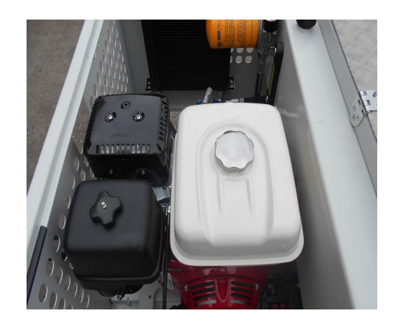
Honda petrol engine